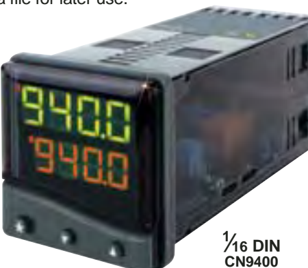
Shown smaller than actual size.

Screen depicting the setup of the cloning function for multiple controllers. When a satisfactory instrument configuration has been achieved, these settings can be cloned to other instruments on the network or saved to a file for later use.