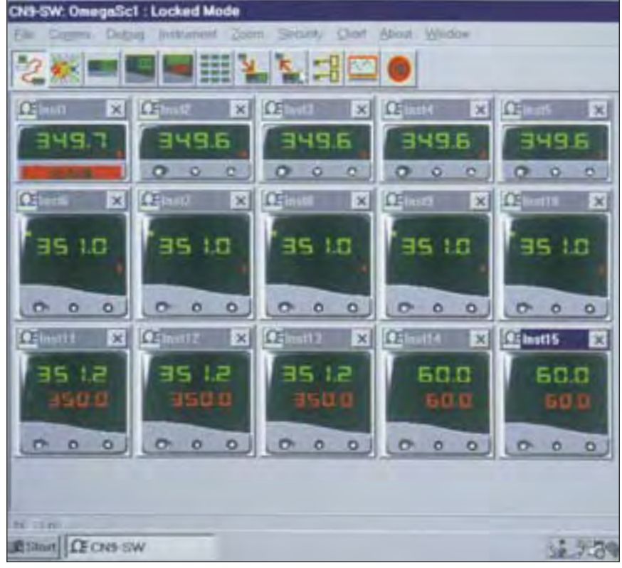
Screen displaying alarm condition on instrument 1. Software alarms provide a screen indication if the measured value falls below the low alarm and/or rises above the high alarm settings.