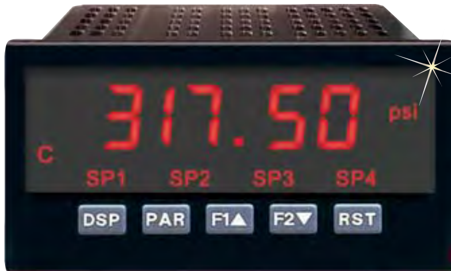
DP63800-E, $243, shown larger than actual size.

The DP63800 Series panel meters offer many features and performance capabilities to suit a wide range of industrial applications. Models include universal DC process inputs. The optional plug-in output cards allow the opportunity to configure the meter for present applications while providing easy upgrades for future needs. The meters have a bright 14.2 mm (0.56") LED display. The unit is available with a red, sunlight-readable or a standard green LED. The intensity of display can be adjusted from dark-room- to sunlight-readable, making it ideal for viewing in variable light applications.