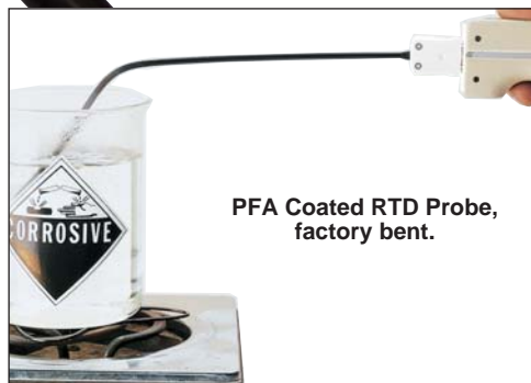
PFA Coated RTD Probe, factory bent.

RTD probes that are available with PFA coatings are the PR-11, PR-12, PR-13, PR-14, PR-15, PR-16, PR-17, PRS-GP and PRS-FR, as well as the RTD-810 probe.