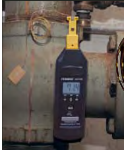
HH74K, $55, shown with optional SA1-K-SC, self-adhesive thermocouple, $75 for package of 5. Search omega.com