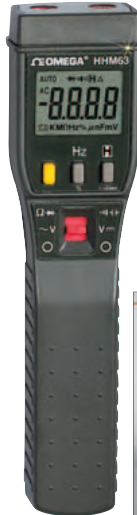
HMM63 Stick Type Multimeter 2500 count resolution W/Microprocessor-Based DMM DCV Accuracy: 0.25% Resistance accuracy: 0.3% Backlit LCD display Frequency accuracy up to ± 0.05% Frequency resolution up to 0.001 Hz