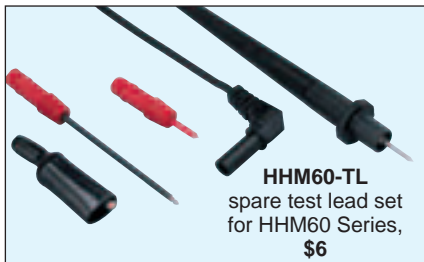
HMM60-TL spare test lead set for HMM60 Series, $6