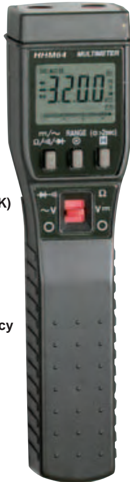
HMM64 Stick Type Multimeter 3200 count resolution Analog bargraph function Backlit LCD display DCV accuracy: 0.25%