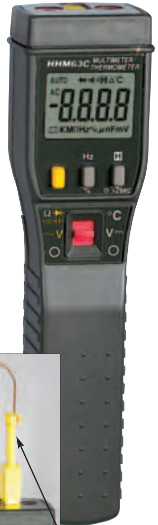
HMM63C/HMM63F Multimeter Thermometer 2500 count resolution W/microprocessor-based DMM DCV accuracy: 0.25% Resistance accuracy: 0.3% Backlit LCD display Frequency accuracy up to ± 0.05% Frequency resolution up to 0.001 Hz Type K input Temp. accuracy ± 2%