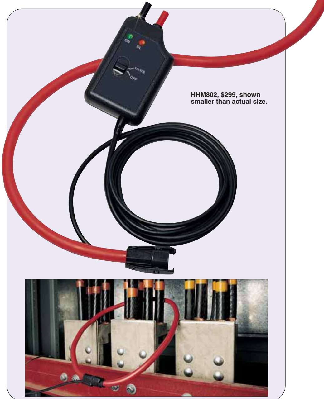
HHM802, $299, shown smaller than actual size.

In particular, it can be installed in tight spaces, around cable bundles, around wide or large bus bars or even wrapped around irregularly shaped objects. Probe design enables the user to pre-shape the sensor before inserting it between or around conductors. This feature facilitates positioning the sensor around the conductor, enhances user safety and alleviates the drooping effect associated with other flexible