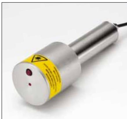
Laser sighting tool.