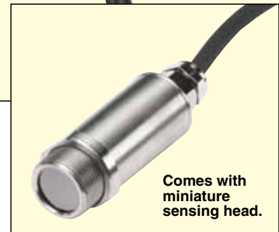
Comes with miniature sensing head.

Touch screen for temperature indication and configuration.