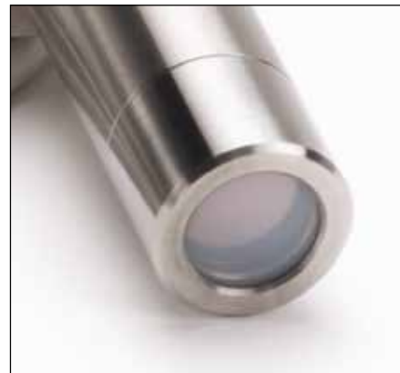
Protective plastic window.***