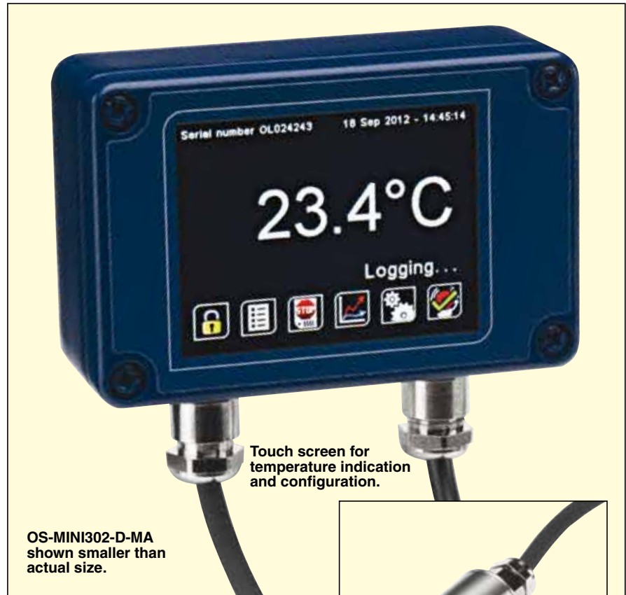
OS-MINI302-D-MA shown smaller than actual size.

Touch screen for temperature indication and configuration.