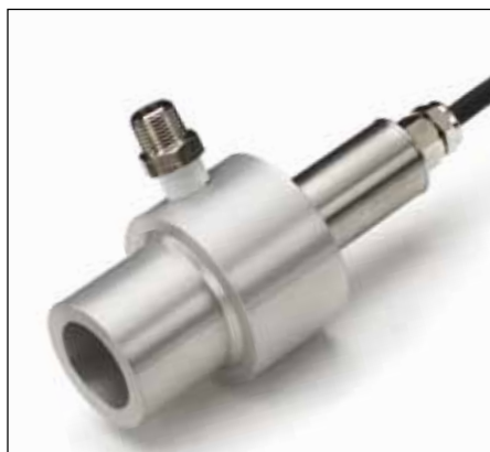
Air purge collar.