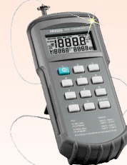
HH505, Handheld Thermometer, $75. See page L-62.