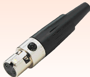
TA3F, Connector, $17. See page G-54.