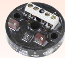
TX904, Transmitter, $173. See page N-15.